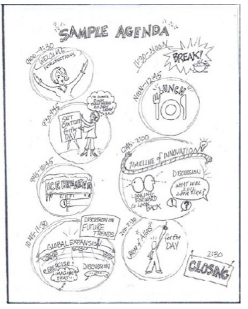
Figure 1 is an example of Visual Agenda.

Often a professional graphic facilitator / recorder is hired for conferences or meetings. However, at the unConference, we wanted to introduce the art and skill of graphic work to our student interns, thinking this might be a career area that might interest them. To do this we offered a graphic facilitation workshop the day before the unConference started. Interns had to sign up in advance for the session, and we told them no previous art or graphics skills were required – only a willingness to learn, take risks, and have fun was needed.